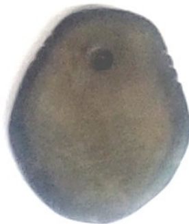
The Camp Pioneer Gorget